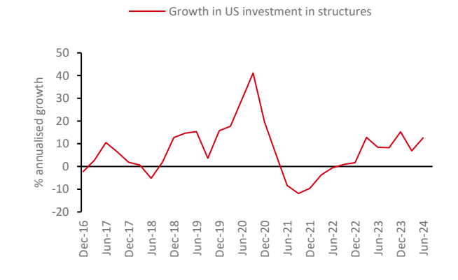
Chart 2: US companies' capital investment continues at a solid clip Structures (building of factories and warehouses)